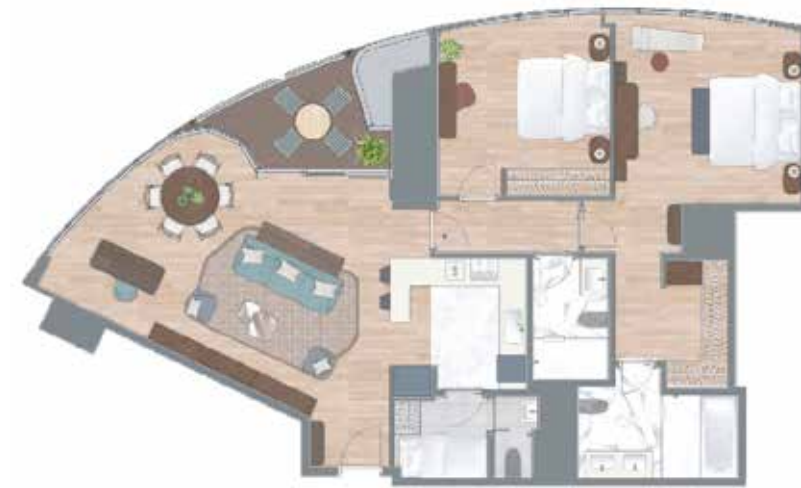
*Artist's perspective for illustration purposes only.

Approx. 141 - 142 sqm Approx. 1517 - 1528 sqft