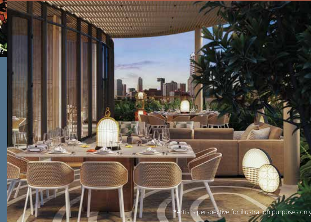
*Artist's perspective for illustration purposes only.

The outdoor amenities of Haraya Residences offers over 2,500 square meters of thoughtfully designed outdoor amenities, featuring a variety of beautifully tended green spaces and private nooks. Unwind with the whole family in the swimming pools and kid's play areas; decompress in the jacuzzi after a day at the office; rejuvenate with some outdoor yoga under the swaying trees.