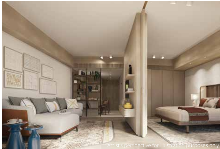
*Artist's perspective for illustration purposes only.