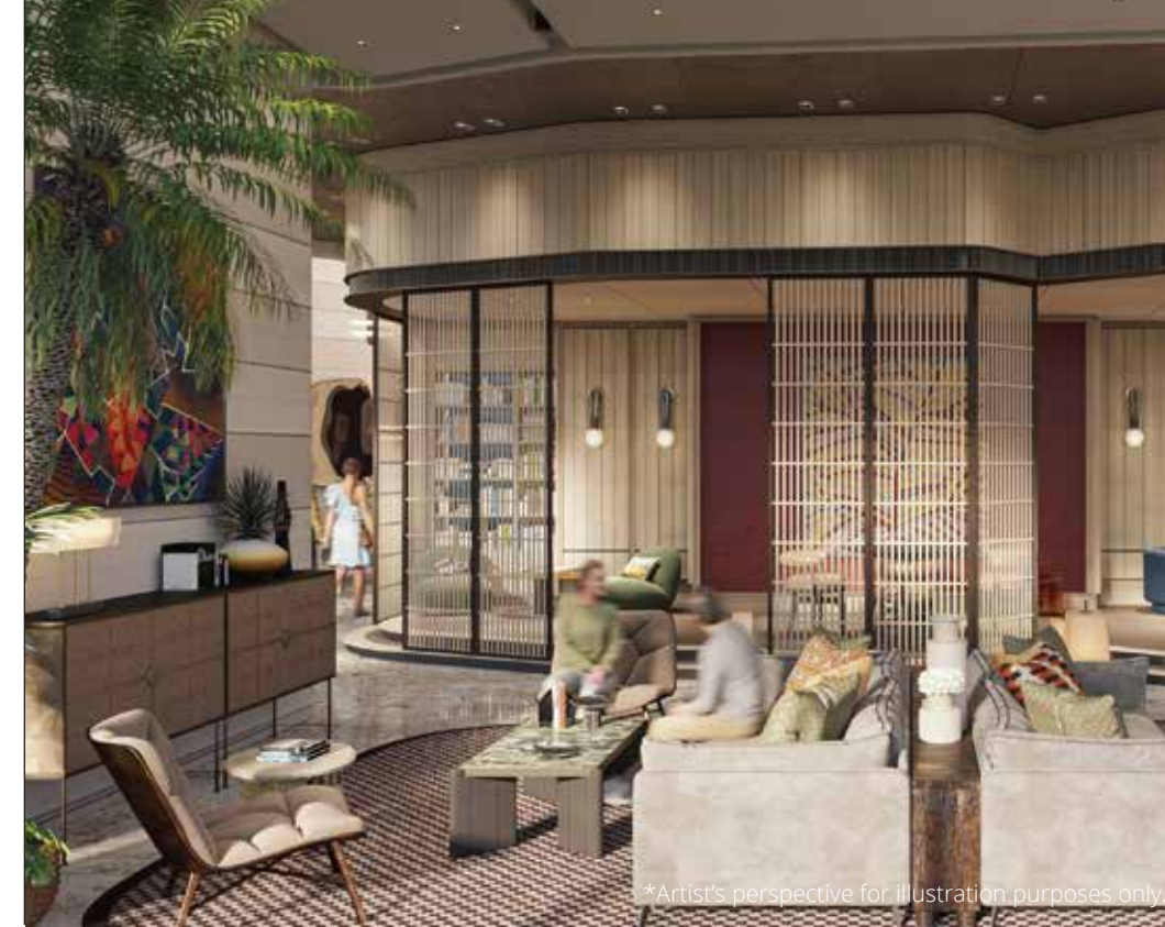
*Artist's perspective for illustration purposes only.

Project Location: Riverside Road corner Bridgetowne Blvd., Bridgetowne Destination Estate, E. Rodriguez Ave., Brgy. Rosario, Pasig City Developer: Shang Robinsons Properties, Inc. Land Owner: Robinsons Land Corp.