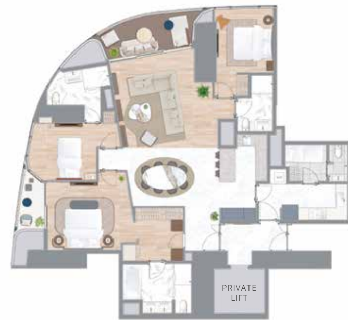
*Artist's perspective for illustration purposes only.

Approx. 186 - 187 sqm Approx. 2002 - 2012 sqft