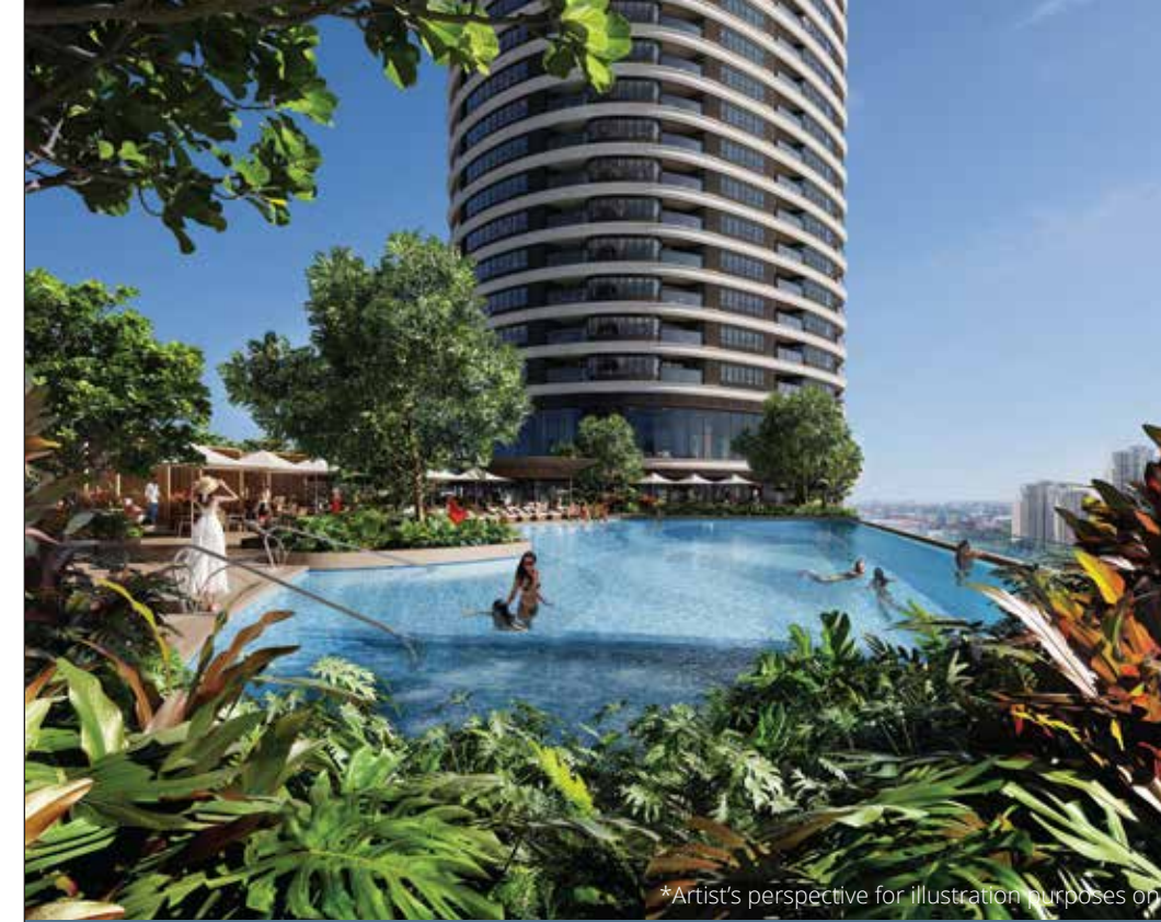
*Artist's perspective for illustration purposes only.