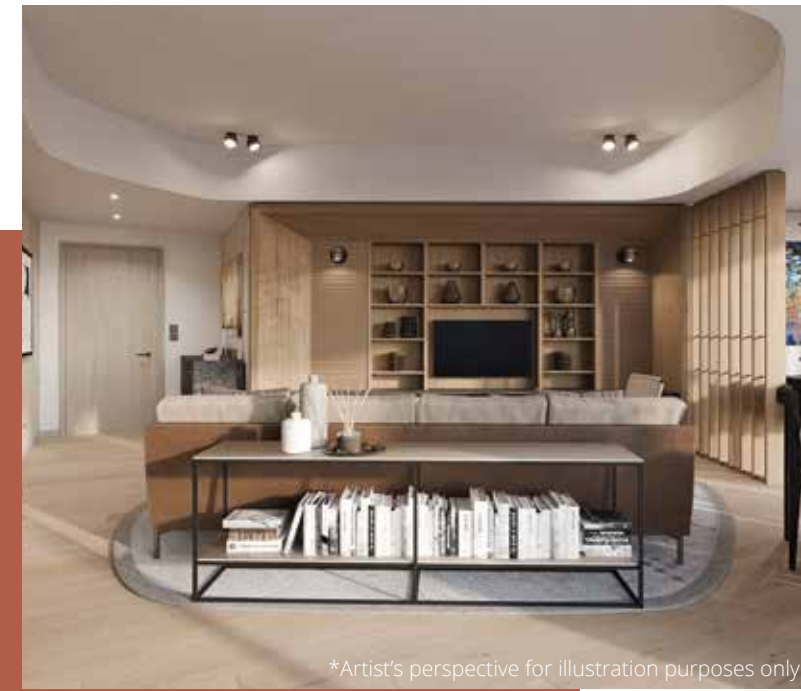
*Artist's perspective for illustration purposes only.