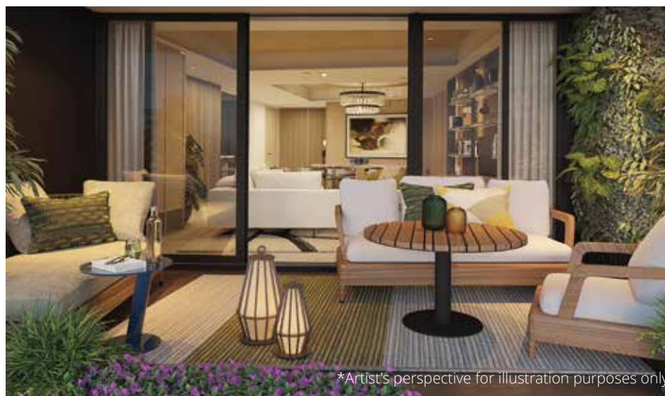
*Artist's perspective for illustration purposes only.