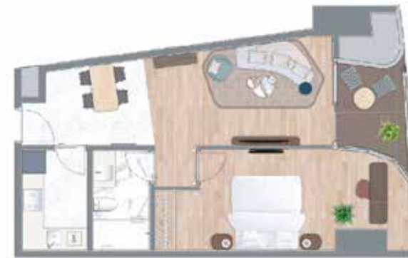
*Artist's perspective for illustration purposes only.

Approx. 66 - 67 sqm Approx. 710 - 721 sqft